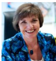
HON ANNE TOLLEY

Anne Tolley has been MP for the East Coast since 1999 and has held a number of ministerial portfolios, including Police and Corrections. She was appointed Minister for Social Development in 2014